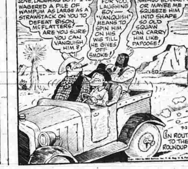
MAJOR HOOPLE BY V. T. HAMLIN