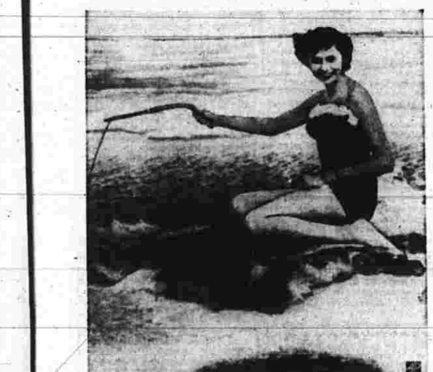
PRESENTING MISS LIBERTY — San Juan, P. R. — Presenting Miss Liberty — San Juan, P. R. — Presenting Miss Liberty — San Juan, P. R. — Presenting Miss Liberty — San Juan, P. R.