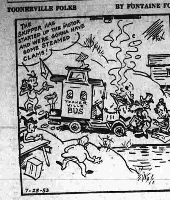
TOONVILLE FOLKS BY FOUNTAINE FOX