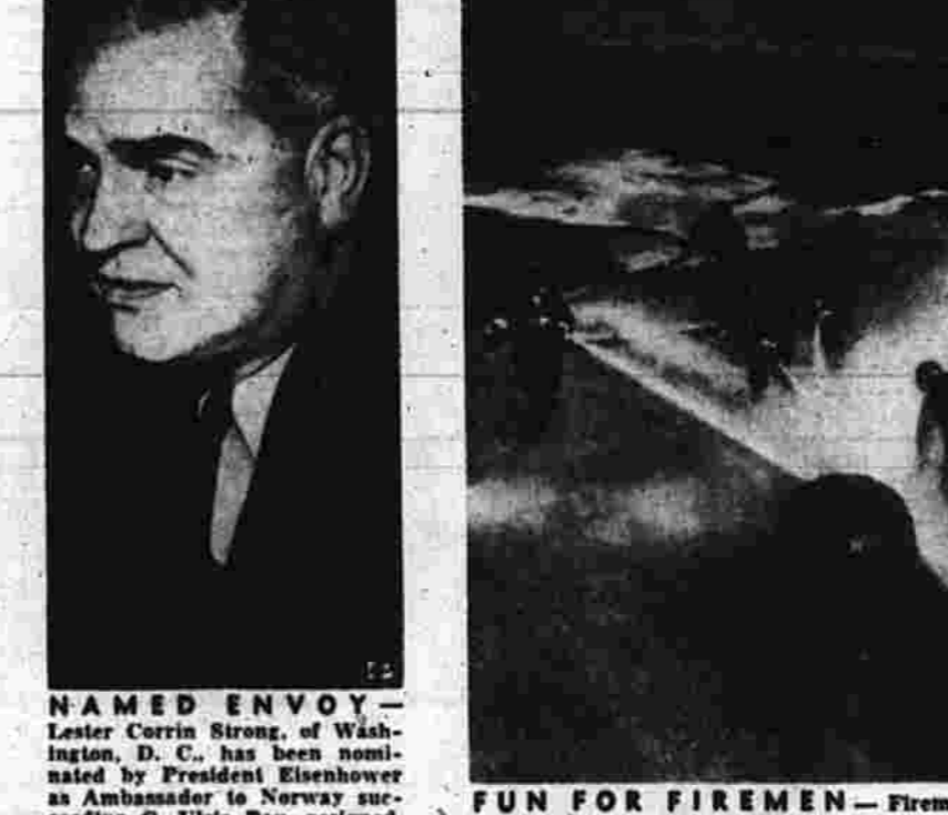
FUN FOR FIREMEN — Firemen turn to waterball with fire hoses in exhibition of fire fighting at Essen, Germany. Degree of dampness was not a factor in choice of winners.