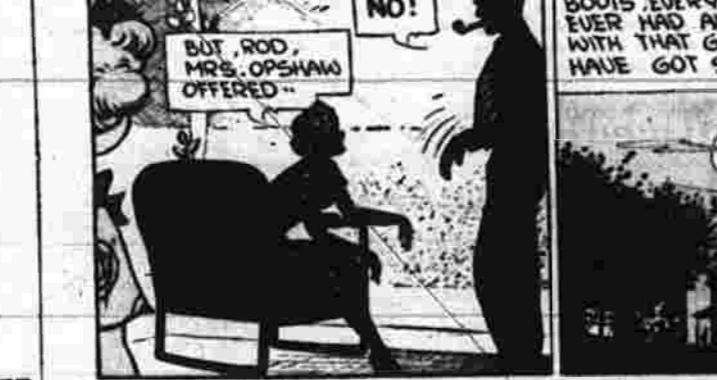
FRECKLES AND HIS FRIENDS BY LESLIE TURNER