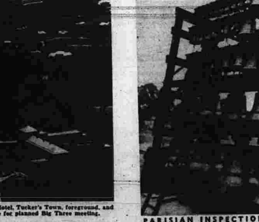
PARISIAN INSPECTION — A workman and a curious rumpster study a huge chime, composed of 48 bells weighing from 44 to 1,322 pounds, destined for Paris' Eiffel Tower.