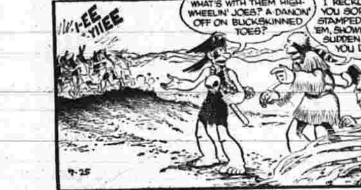
ALLEY OOP BY V. T. HAMLIN